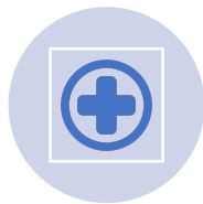
FIRST AID RESPONSE