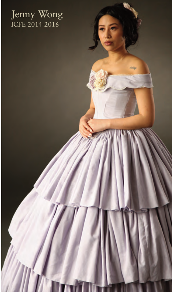
Costume from 1856

The period in which I chose to base the design of my dress, is the Victorian era. I was mainly inspired by what was fashionable in Paris during the mid-nineteenth century. The outer part of my costume comprises one triple tiered and pleated floor-length, a bell-shaped flounced skirt, the top layer is cartridge pleated meaning that there's a lot of fabric condensed into the skirt, the bottom two layers were pleated normally. The bodice is slim fitting with a scalloped bertha, the top and bottom of the bodice and also the edge of the bertha is trimmed with lace, and there are three artificial roses which sit in the centre of the bertha. The dress also includes one petticoat and one cage crinoline. I chose this year specifically because it was the year the cage crinoline was invented and I was extremely interested in how it was constructed.