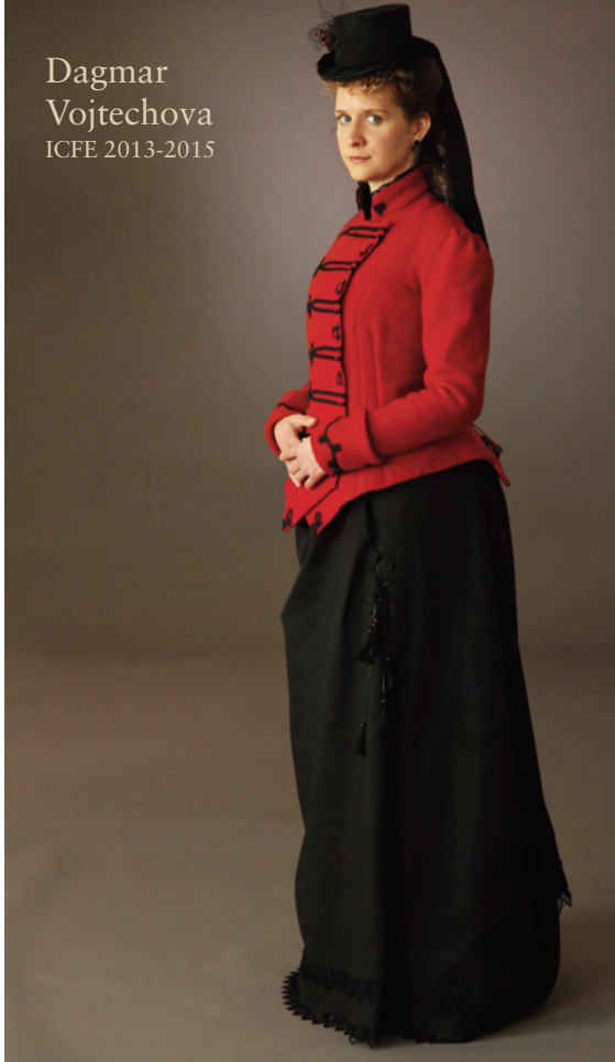
Costume from 1885

This Victorian riding habit with its tailored jacket is inspired by Hussars Army uniforms, a history closely connected to my country, Slovakia; once a part of the Austrian-Hungarian Empire. Victorian fashion was a very beautiful and elegant one, although quite restricting to its wearer. I made a costume in bold red and black combination, that I imagined would be worn by a strong, brave and self-reliant lady because horse riding in that era was still considered a bit daring for a “proper” Victorian gentlewoman.