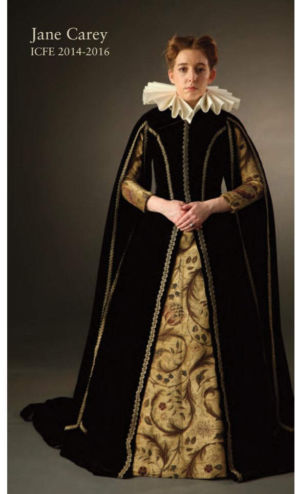
Costume from 1575, Spanish

I chose this style as I love the silhouette of this era. I love the opulence and extravagance. I chose velvet as it is very luxurious and looks expensive, and it was a very popular fabric among the wealthy in this era.