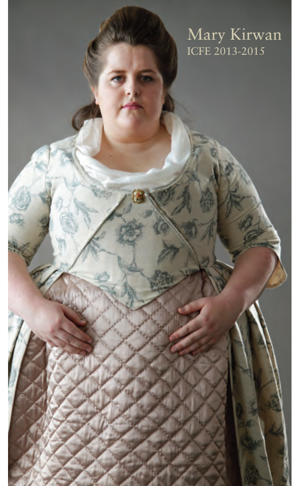
Costume from 1780

I was attracted to this style of dress because of the variety of techniques required to make it. As I am more interested in the construction of costume rather than the design, I looked at this project as an opportunity to learn different skills. Included in my costume is a quilted petticoat, 'Robe a l'Anglaise' style bodice, polonaise skirt and a fichu. Quilted petticoats were a popular garment to wear in the 18th century due to the warmth they provided. As the sewing machine was yet to be invented at this time, to ensure an authentic look, I quilted this petticoat by hand.