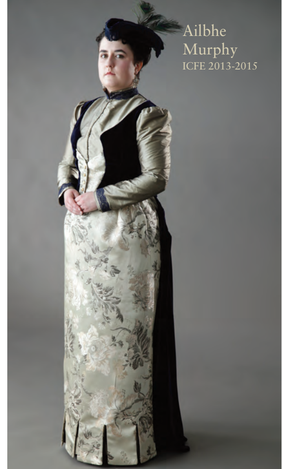
Costume from 1889

I am hoping to continue studying Costume and Design in IADT and also concentrate on my interest in constructing costumes for Cosplay conventions.