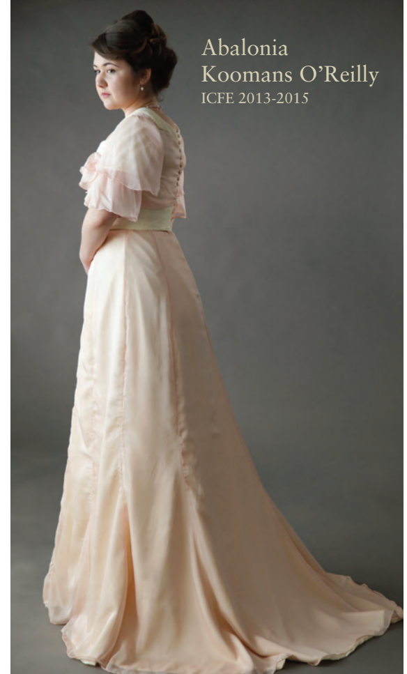
Costume from 1905