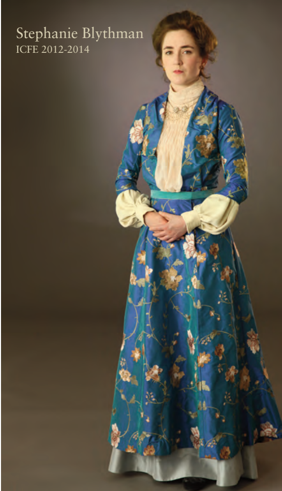
Costume from 1903

This gown is based on a pattern for a 1903 Afternoon Gown drafted by Janet Arnold from an existing museum piece and totalled 22 individual pattern pieces in the end. The original gown was made in a plain wool crepe but I wanted the challenge of working with a patterned fabric and so chose this embroidered dupion for the main body of the gown with the false blouse in chiffon mounted on silk crepe.