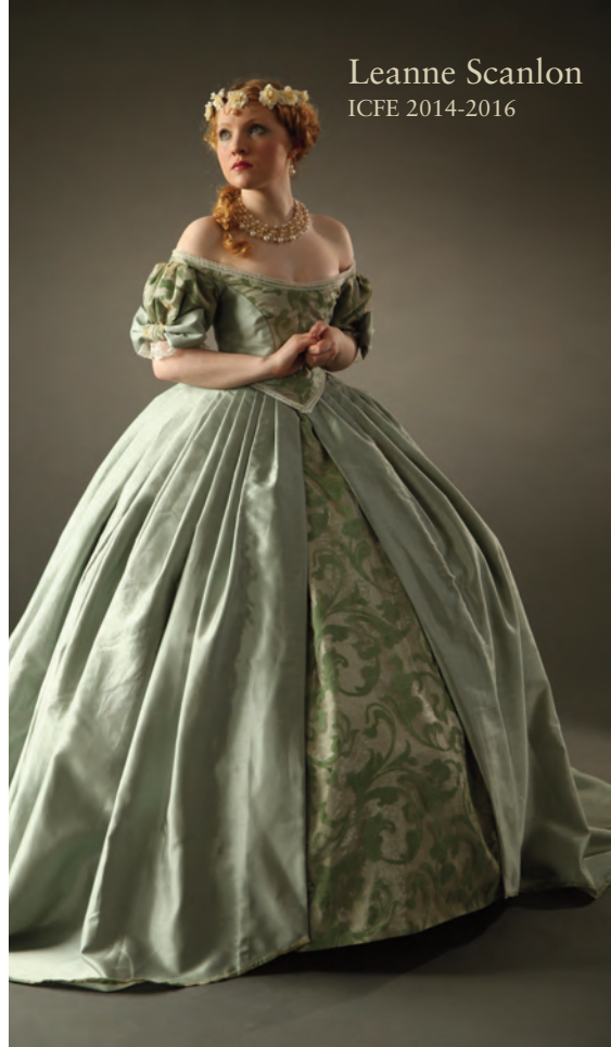
Costume from 1867

This costume is strongly inspired by the coronation gown worn by Empress Sisi and Queen of Hungary. The costume is constructed from taffeta, and a crystal fabric that has a flocking pattern lace and pearl detail.