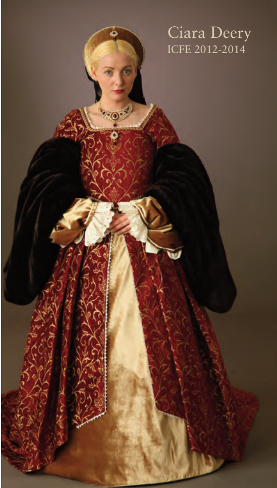
Costume from 1550

I was drawn to this style by the rich colour brocades and trims. The voluminous clothing is worn in a series of layers consisting of a corset, bodice, Spanish farthingale, gold underskirt and overskirt with a train. Sleeves were the centre of attention, worn oversized and turned back to reveal contrasting under sleeves. The abundance of fabric makes it very heavy to wear.