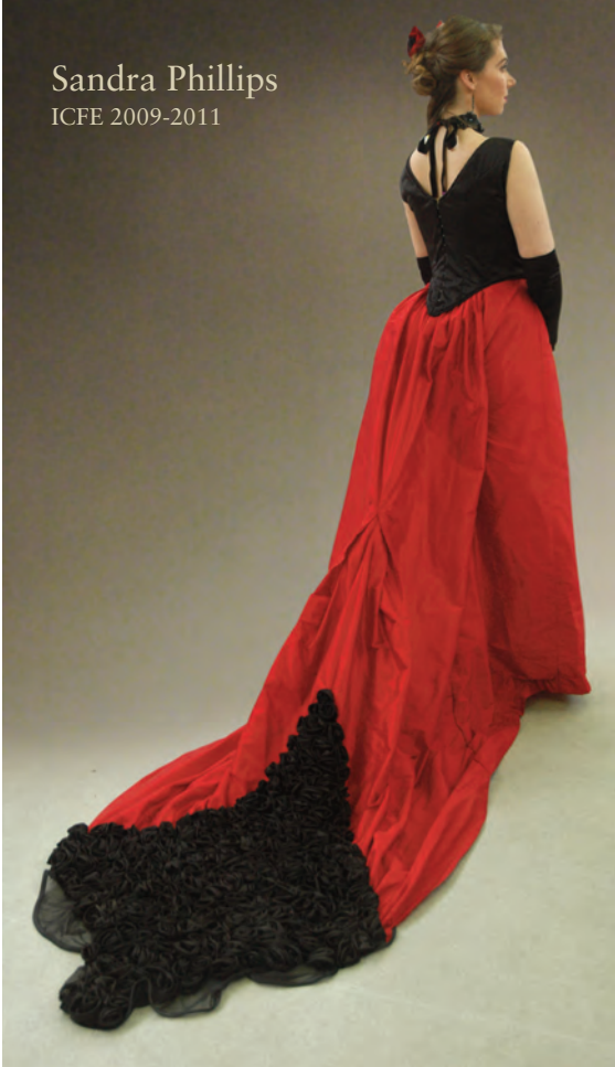
Costume from 1885

I love the Victorian Era and decided to adapt an 1885 pattern for a skirt and bodice combination. The black satin bodice is a straight-forward Victorian structure with a decorative layer over the bust. The long red silk skirt features an insert of hundreds of handmade black satin roses. I love the combination of these two colours, the textures of the fabric used and the detail of roses at the back, compared to the general simple design of the rest of the costume.