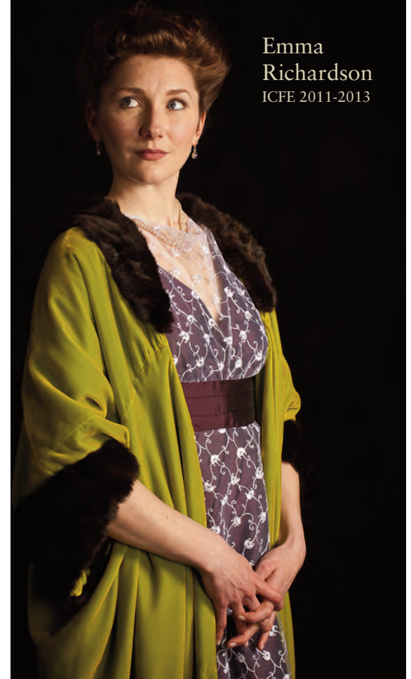
Costume from 1913

My dress is made from silk and lace, and my coat from velvet, silk, and fur. I was very interested in this time period due to the change in the silhouette and the oriental influence on fashion of the time.