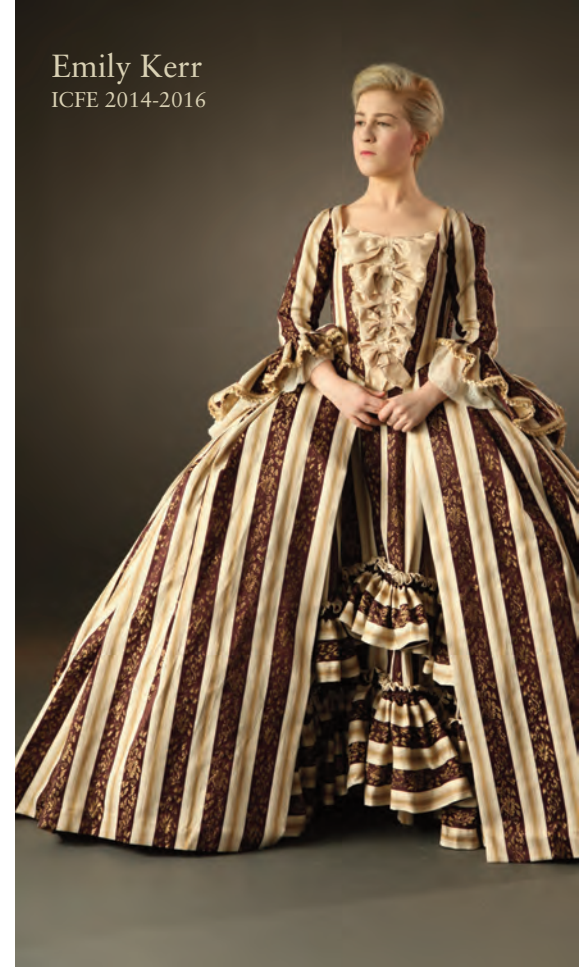
Costume from 1750

The style of costume was chosen because of the combination of a form fitting bodice, and flowing pleats which add to the volume and unusual shape of the sack back. It is also a style that set the pace for the development of dresses during the 18th century, which was also an attractive research point to see where the development started.