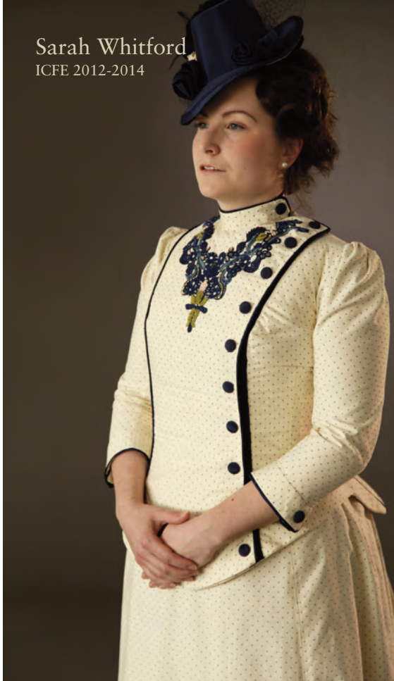
Costume from 1889

I chose to create a Victorian walking costume. The costume is made from a white heavy cotton fabric with blue spots. The bodice sits proud with boning running along the seams for a highly structured look. I designed a lace panel to sit around the neckline. I then dyed it navy and worked up various parts of it with embroidery. I created a number of smaller matching sections which became decorative pieces around the hemline of the skirt. I have used navy braid to create definition and pick out strong lines in the costume. To complete the look, I made a small navy hat adorned with feathers, fabric flowers and netting.